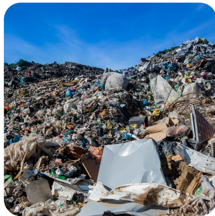
Waste disposal sites