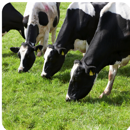
Livestock grazing/outdoor animal confinement