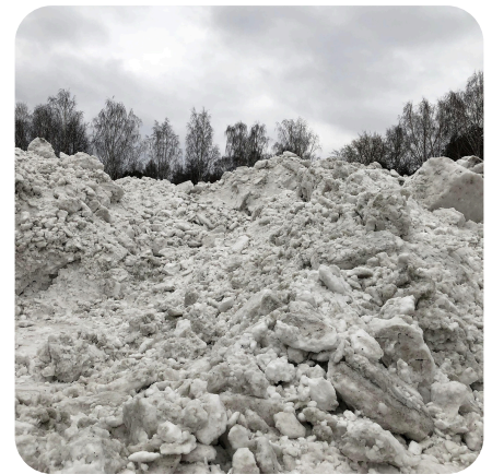
Storage of snow