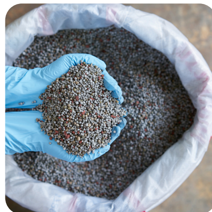
Application, handling and storage of manures, biosolids, and commercial fertilizers