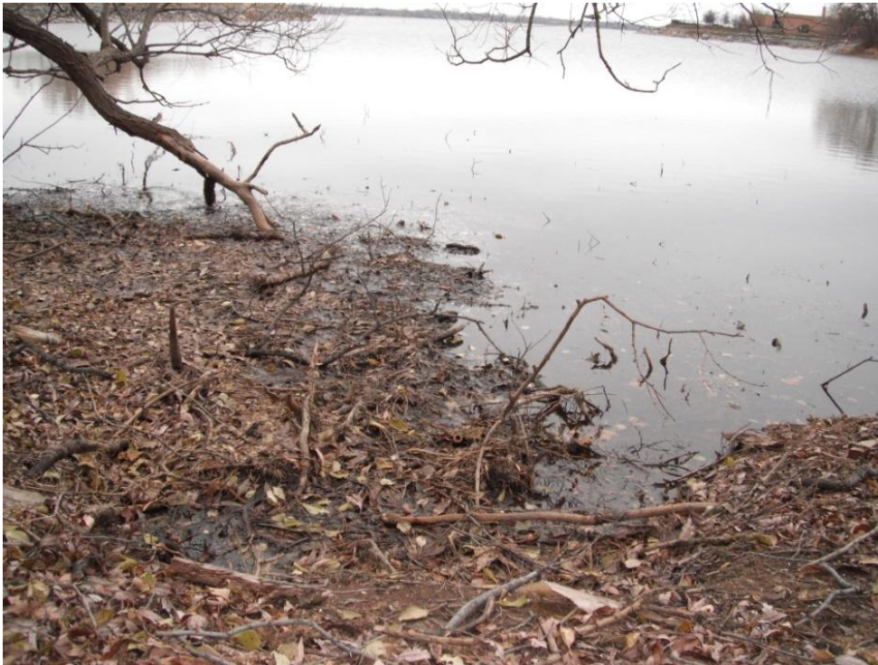
Figure 3: Seep from Zwicks Island Landfill