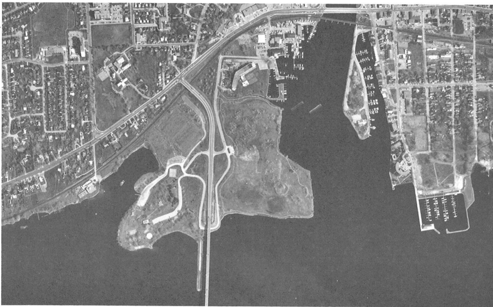
Aerial Photograph 2 (Roll No. 92032-10-132) Zwick's Island, Belleville, May 6, 1992