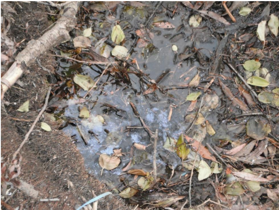
Figure 4: Surface of Seep at Zwicks Island Landfill