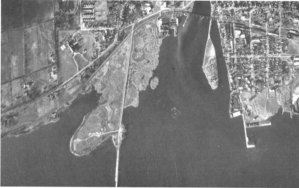
Aerial Photograph 1 (Roll No. A11795-73) Zwick's Island, Belleville, December 3, 1948